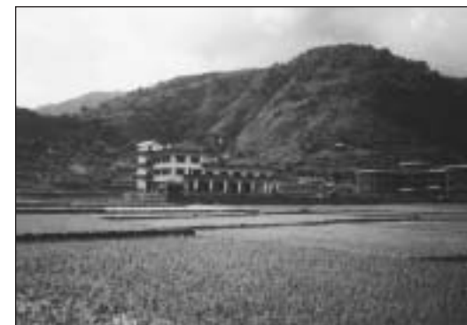
The Refugee Reception Centre in Kathmandu was refurbished in the 1990s after an infusion of funds from foreign aid donors, particularly the United States government.