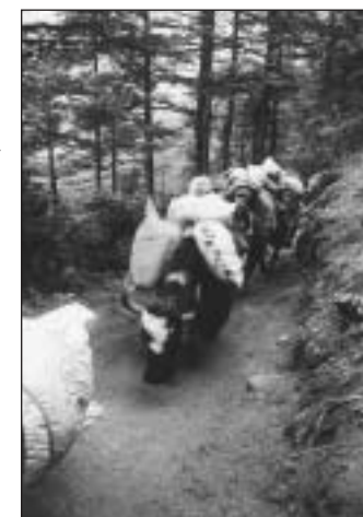
Elizabeth Brundige, June 2001

Despite the harsh terrain in the Himalayan regions, many Tibetans fleeing persecution avoid the main trails used by Nepalese and Chinese traders to avoid apprehension by the police. Reports indicate that some Nepalese police have been forcing Tibetans apprehended within a few days walking distance of the border to return to Tibet in violation of the fundamental principle of non-refoulement .